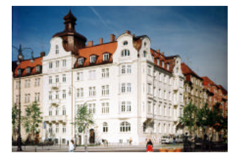
Our UPVC system is certified and approved by the European governing agencies for historical preservation, to be used as a replacement in historical structures.